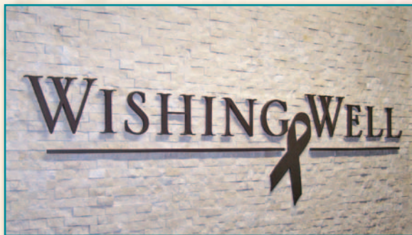
The entrance to the Wishing Well Cancer-Care Specialty Shop.

Wishing Well is open Monday through Friday, 9:00 am to 5:30 pm. For additional questions or to schedule an appointment, call 704.403.6330.