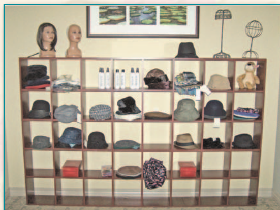
Nightgowns, stuffed animals, pillows, meditational CDs and hats... just a few of the items available for purchase at the Cancer-Care Specialty Shop.