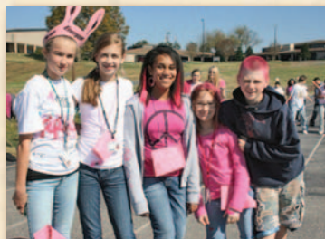
Participating students show their support by wearing pink clothing, holding pink signs, and painting their hair pink.